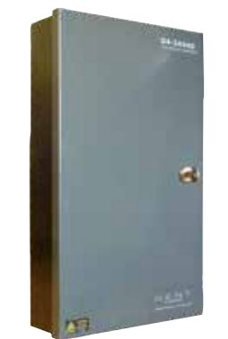
Mains powered interface