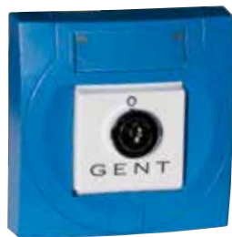
Loop powered key switch operated interface