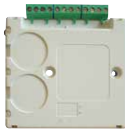
Loop powered 4 channel interface

The new comprehensive range of Vigilon interfaces has a neat compact design casing to give maximum installation flexibility. The range includes low voltage and mains switching variants to meet all application needs. All variants can be installed as either DIN rail mounted or housed in a Vigilon style enclosure. All interfaces are compliant with EN 54 part 18.